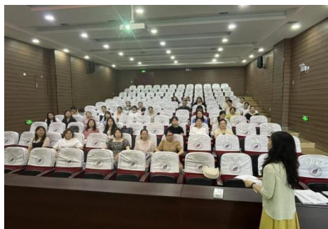
Multi-functional Lecture Hall