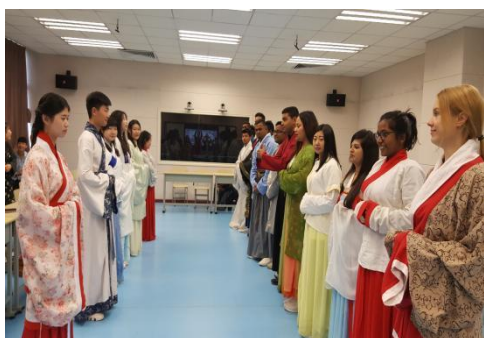
New Zealand students experienced Hanfu Culture