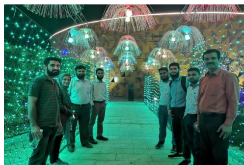
Trip to Lilin(City of Porcelain)