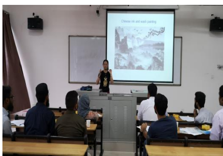
Chinese Language Class