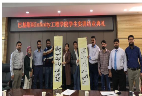
Trainees from Infinity Group, Pakistan joined practical training