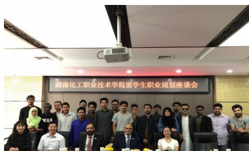
Career Planning Meeting for International Students