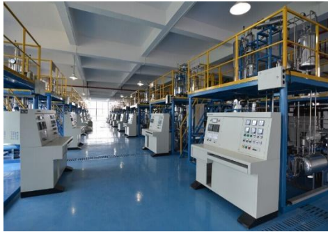
Training Factory for Chemical Unit Operation