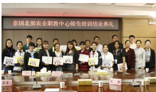
Students from Thailand vocational schools joined practical training