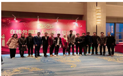
Attending the New Year Reception Party for foreign friends in Zhuzhou