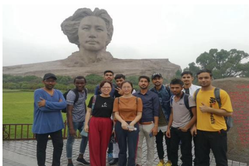
Trip to Orange Isle